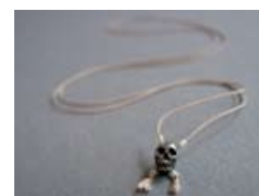
StauffacherBenz (41) 44 271 31 37 mail@stauffacherbenz.ch stauffacherbenz.ch